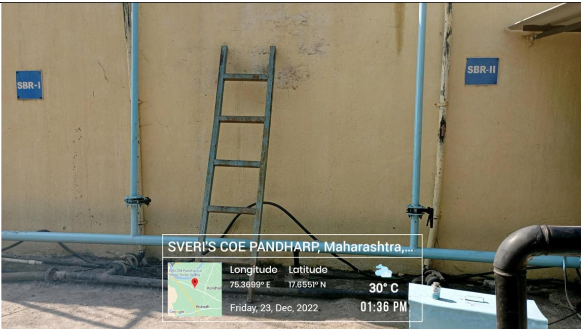
300 MLD Sewage Treatment Plant