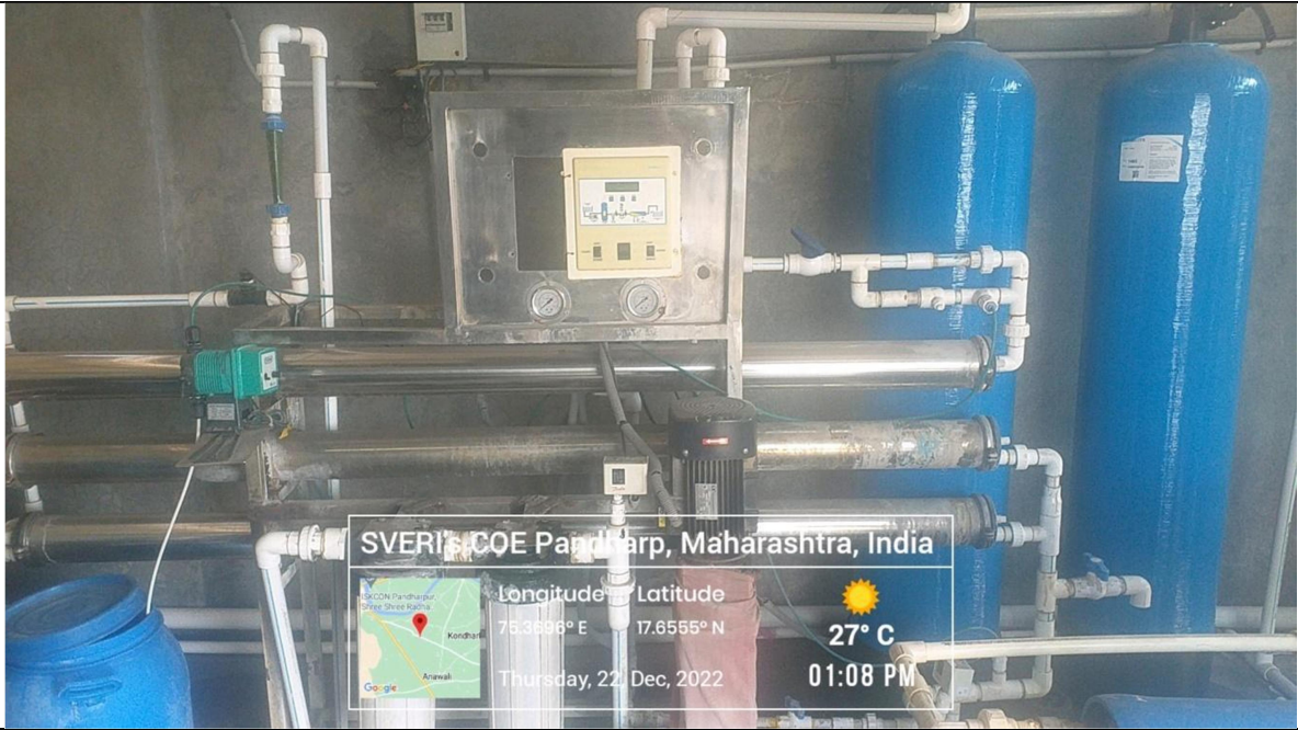
RO Water Recycling Plant capacity 1200 ltr/ hr